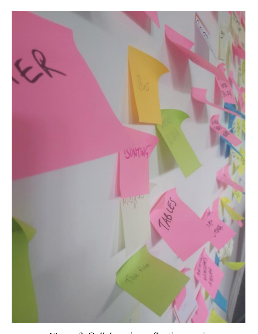
Figure 3. Collaborative reflection on site