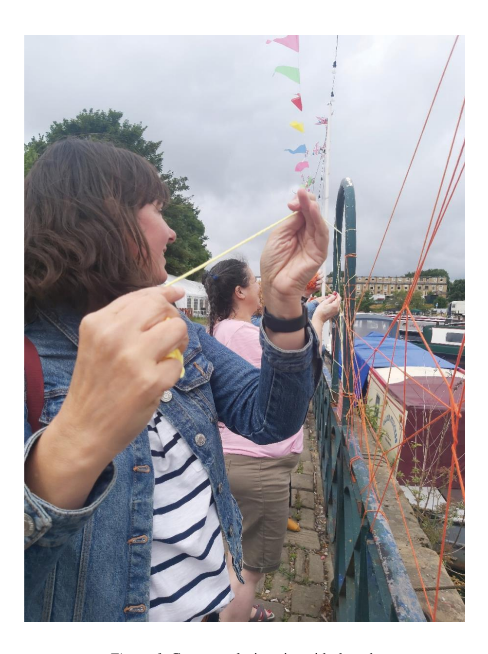
Figure 1. Group exploring site with threads.

The learning outcomes were not made explicit in the programme. The knowledge and skills needed to produce a viable proposal for a socially-engaged arts project were learned through the practical activities, discussion, and reflection planned in the schedule (see Figure 2).