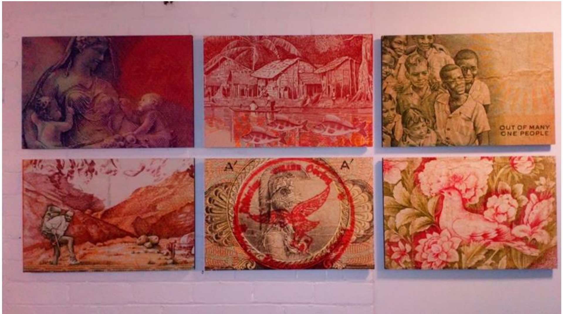
Close Currency. Mounted photographic prints (install). Paul Bennett-Todd.