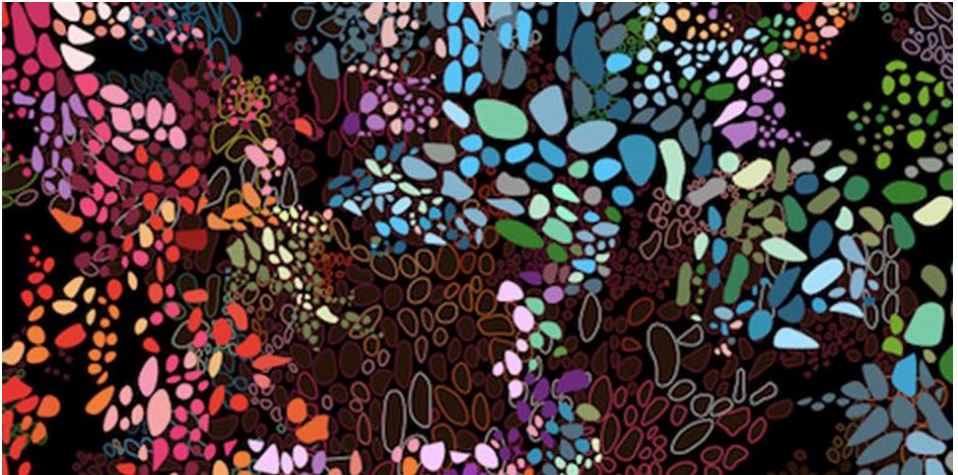
Untitled. Vinyl Print Installation. Joy Hindmoor.