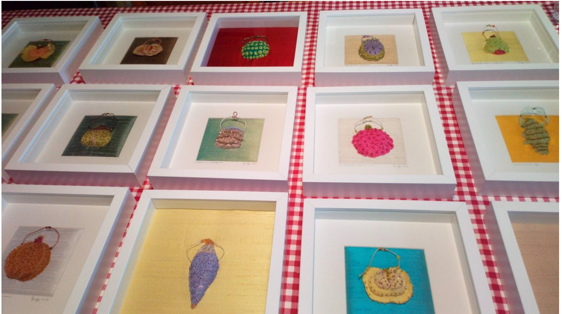
Selection from Seed Catalogue Collection 2 . Boxed embroideries. Sherelene Cuffe.