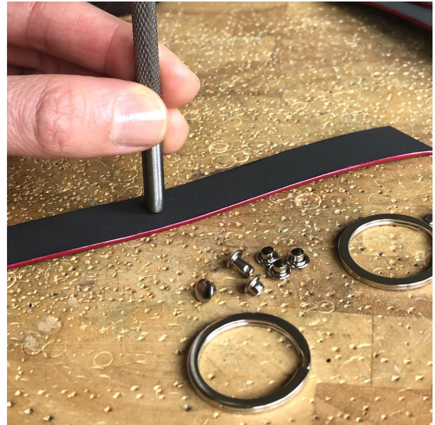
HAND PUNCHING HOLES FOR METAL RIVITS