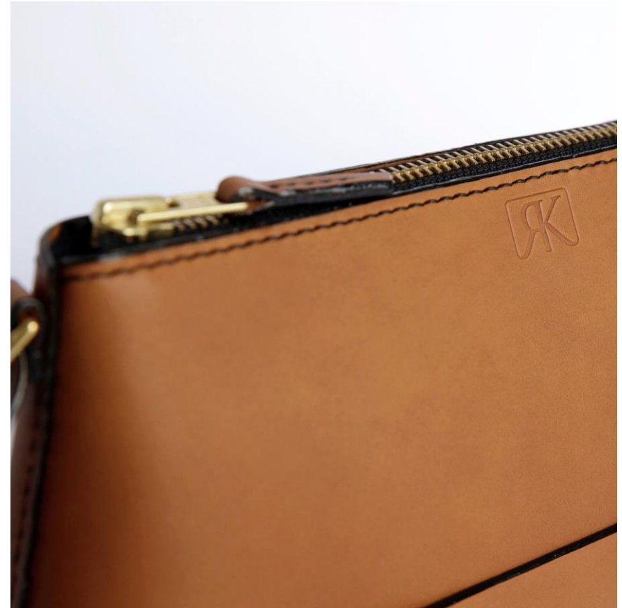
SHOULDER BAG DETAILS - MADE ENTIRLEY BY HAND FROM VEGETABLE TANNED LEATHER