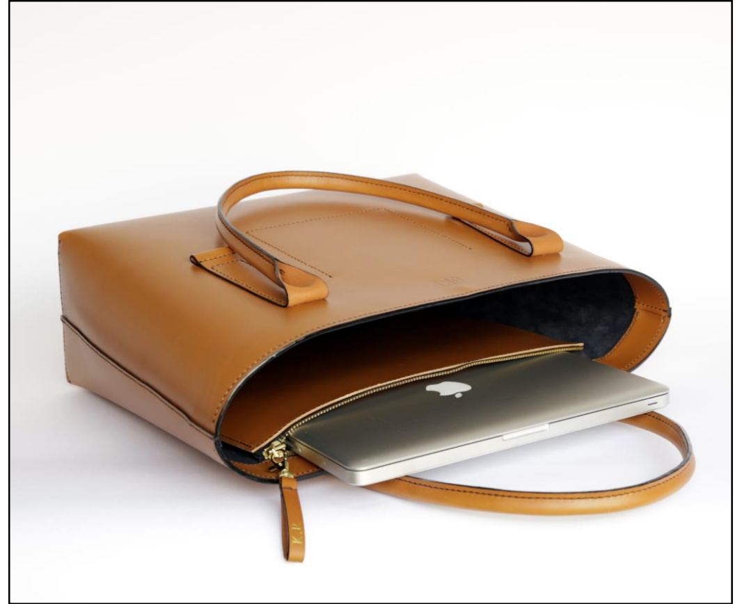
HAND STITCHED VEGETABLE TANNED LEATHER TOTE CREATED USING TRADITIONAL LEATHER MAKING TECHNIQUES, DESIGNED FOR THE MODERN DAY