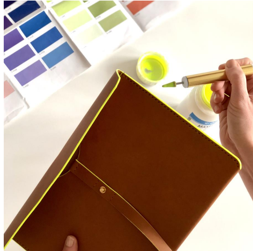
TRADITIONALLY EDGES WERE BURNISHED TO SMOOTH AND FINISH THE EDGES – HERE I'M APPLYING SPECIAL LEATHER EDGE PAINTS TO CREATE A MODERN FINISH