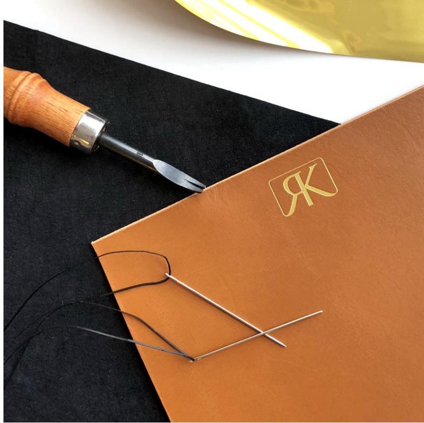
EDGES OF THE VEGETABLE TANNED LEATHER ARE BEVELED USING A SPECIAL TOOL