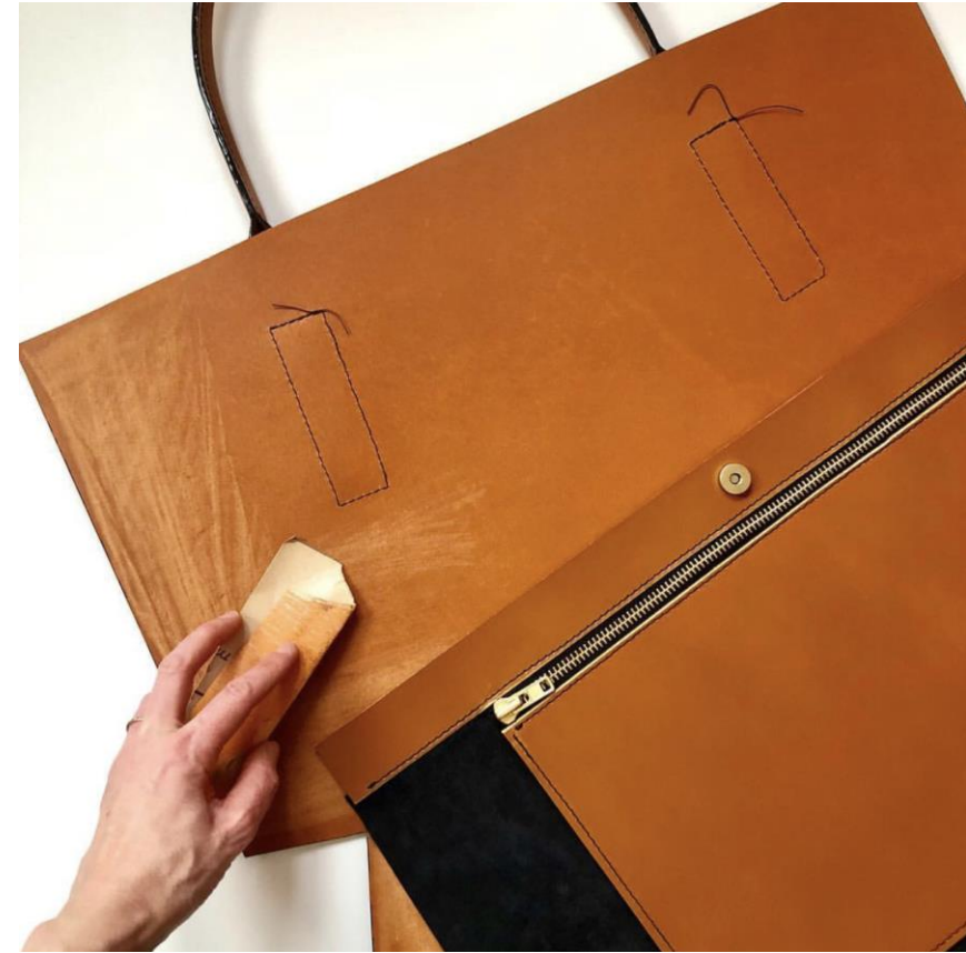
HAND SANDING PREPARES THE SURFACE FOR GLUEING THE LINING. THE TOTE BAG IS MADE FROM VEGETABLE TANNED LEATHER