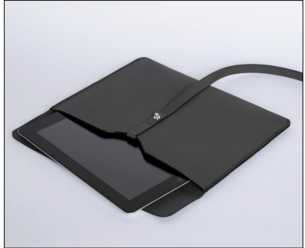
HAND STITCHED VEGETABLE TANNED LEATHER IPAD CASE CREATING MODERN ACCESSORIES USING TRADITIONAL CRAFTSMEN TECHNIQUES