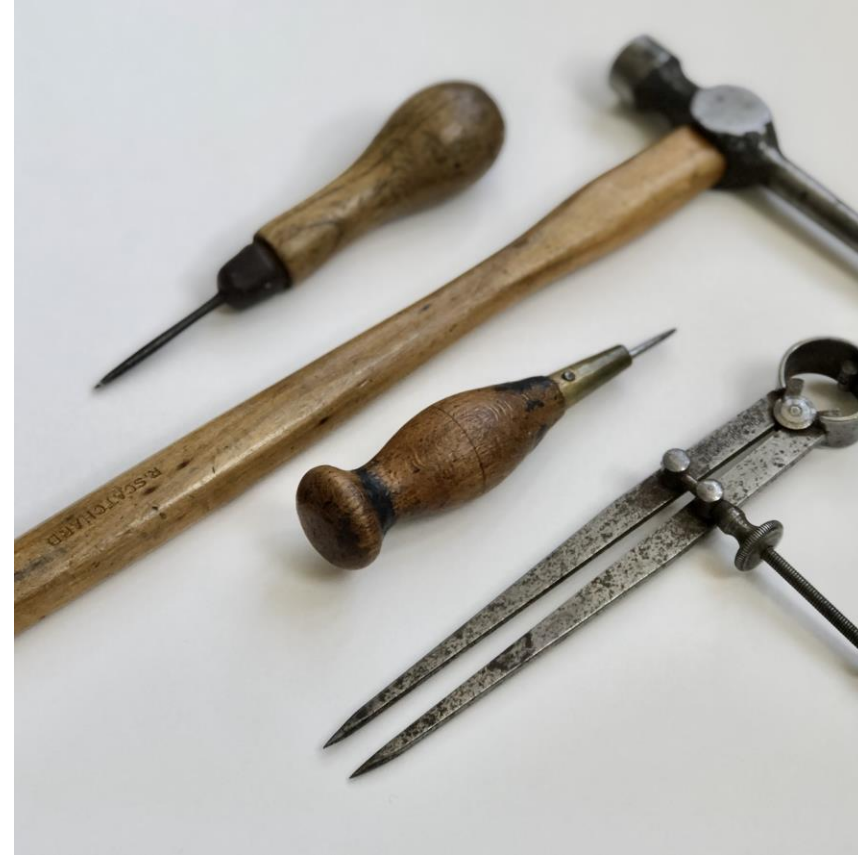
EXAMPLE OF SOME OF THE TRADITIONAL TOOLS USED IN LEATHERWORK