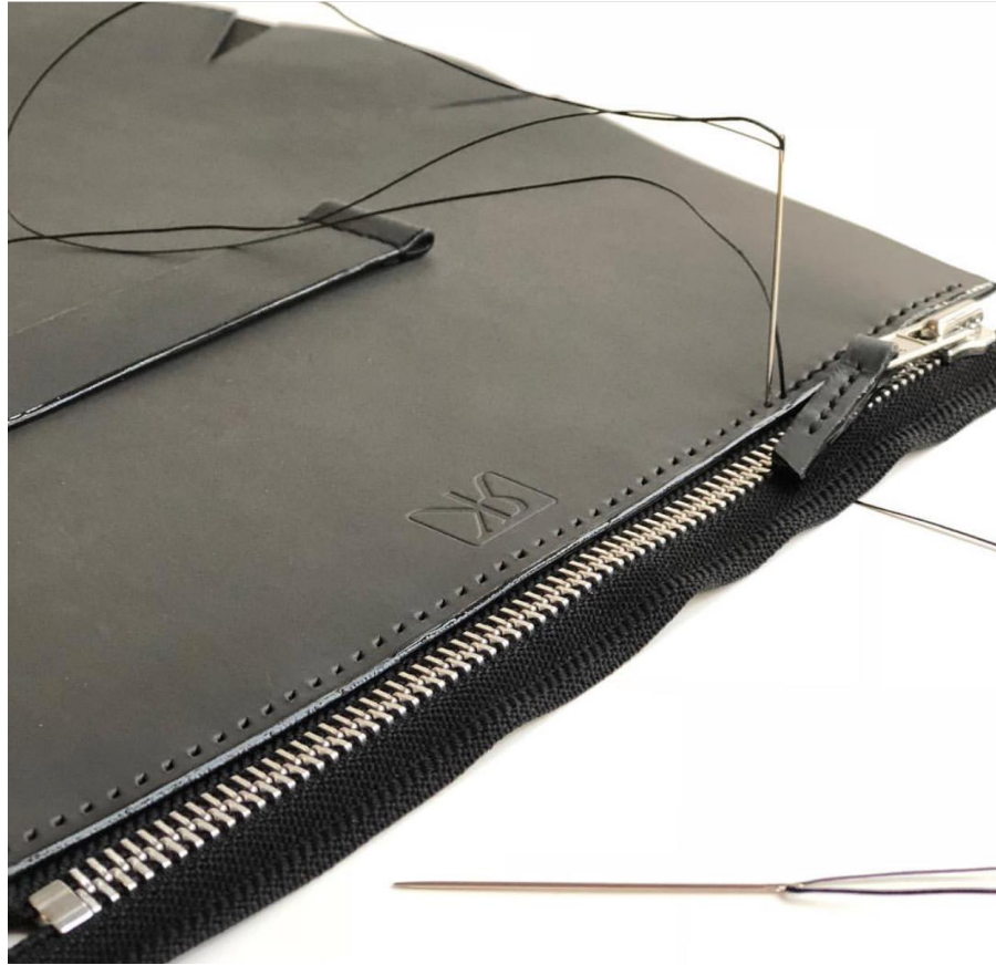
ATTACHING MODERN ZIP FASTENINGS TO A SHOULDER BAG USING HAND SADDLE STITCH