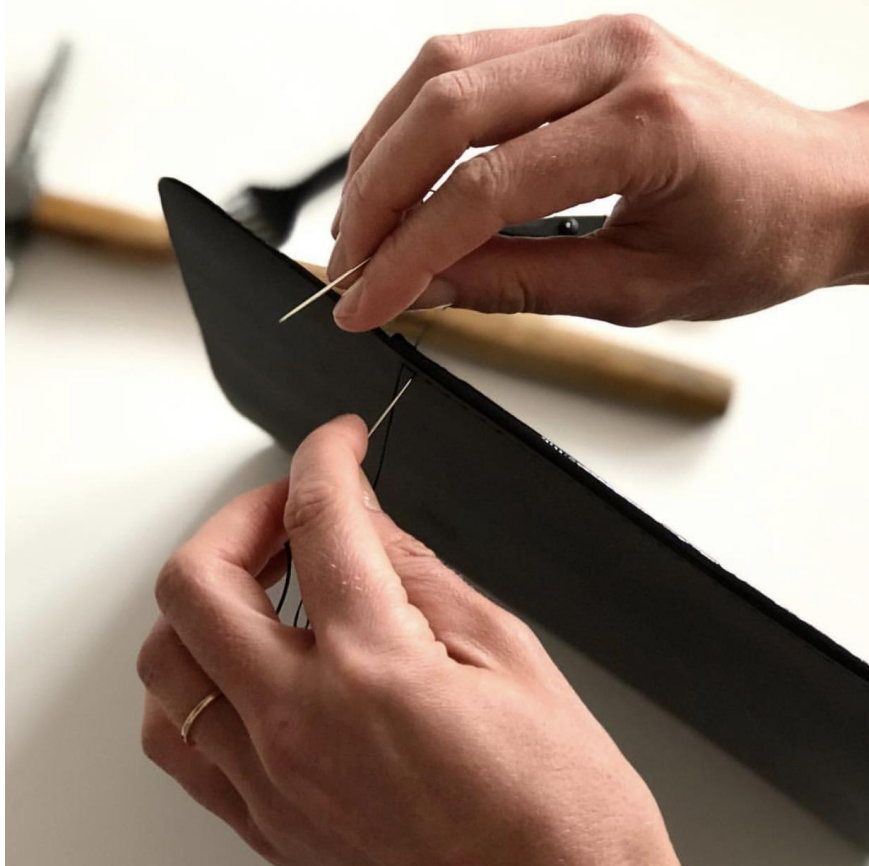
TRADITIONAL SADDLE STITCHING USED HERE TO CREATE AN IPAD CASE