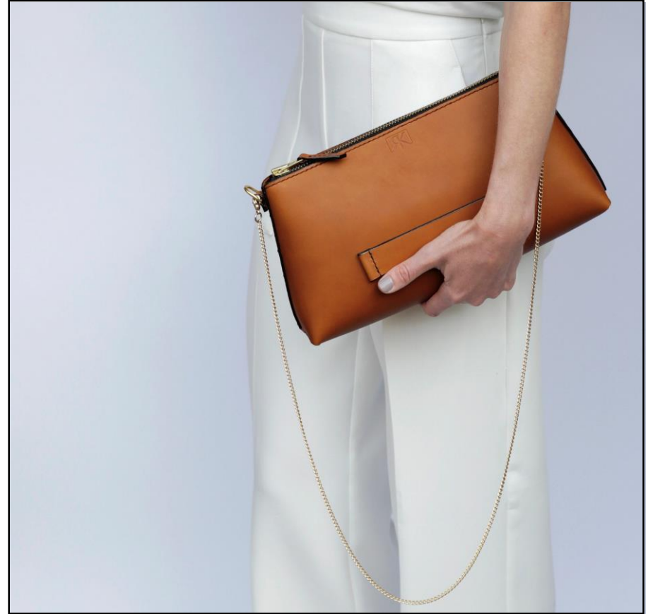
HAND STITCHED VEGETABLE TANNED LEATHER SHOULDER BAG CHANGEABLE STRAPS FOR MODERN EVERYDAY USE