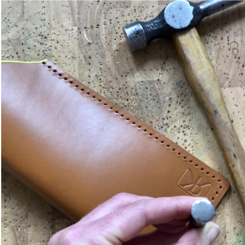
PUNCHING HOLES INTO A GLASSES CASE – 6 STITCHES PER INCH