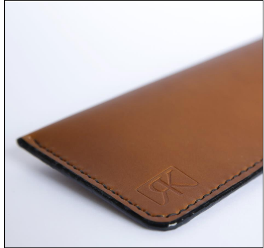
HAND STITCHED VEGETABLE TANNED LEATHER GLASSES CASE WITH HAND PAINTED BLACK EDGING AND GLOSS TOPCOAT