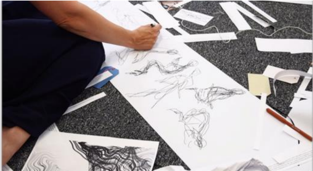
L.php (PhEMaterialism, 2018).