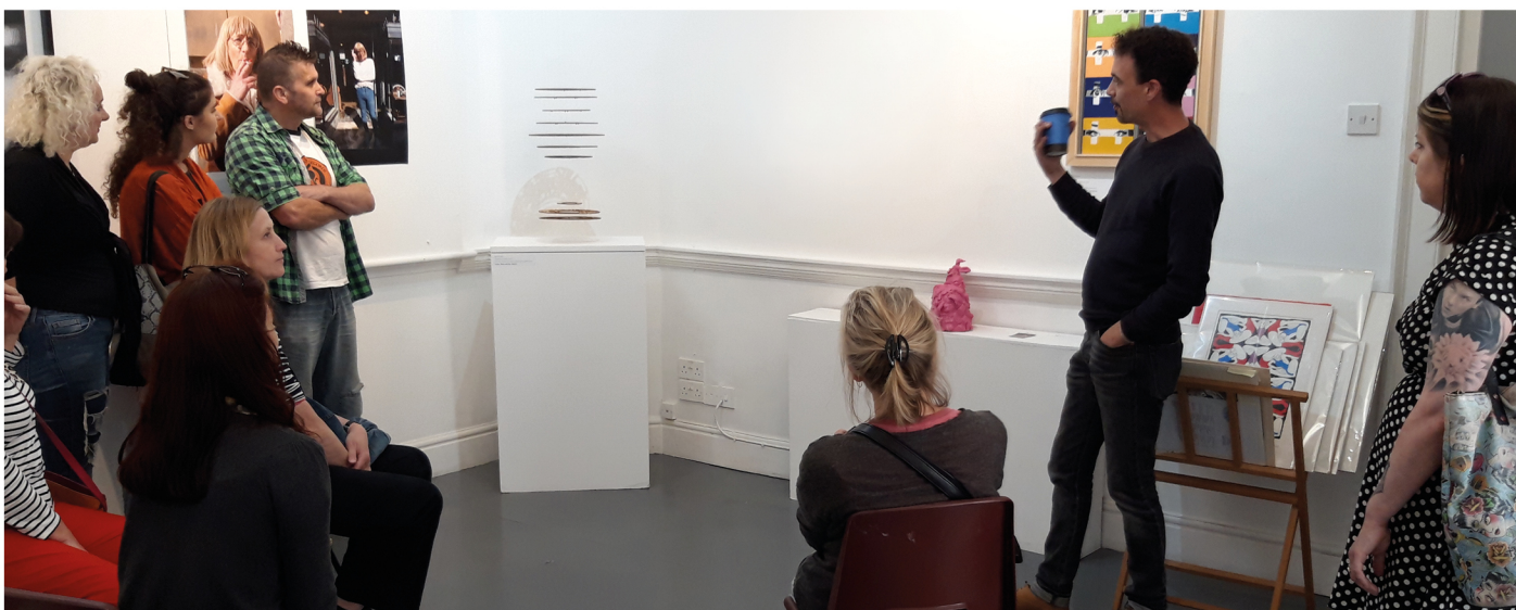
a(muse) Eightwonder 2019 44ad Artspace, Bath. 08 - 18 August 2019.