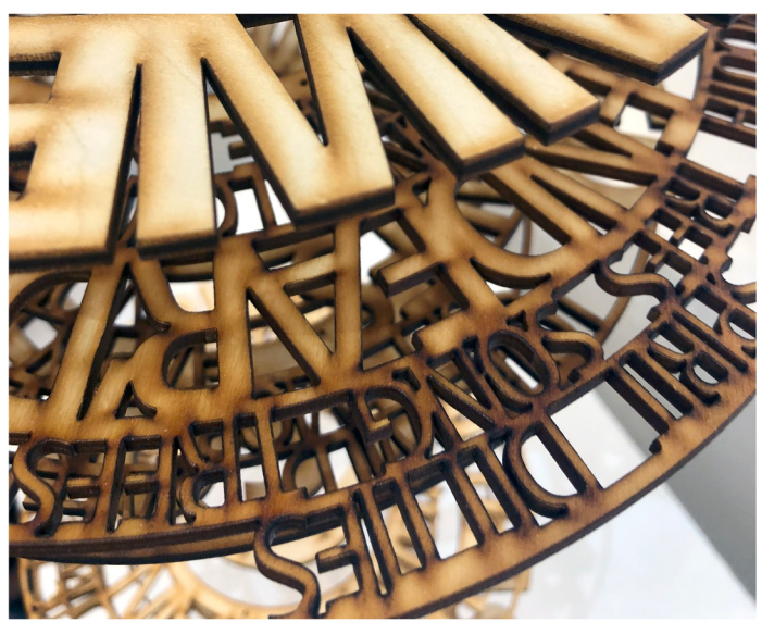
a(muse) Eightwonder 2019 44ad Artspace, Bath. 08 - 18 August 2019.