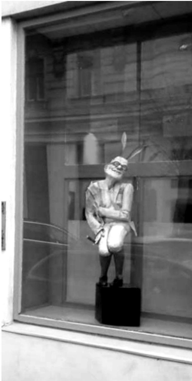
Nicholas Treadwell Gallery, Vienna. (exterior window)