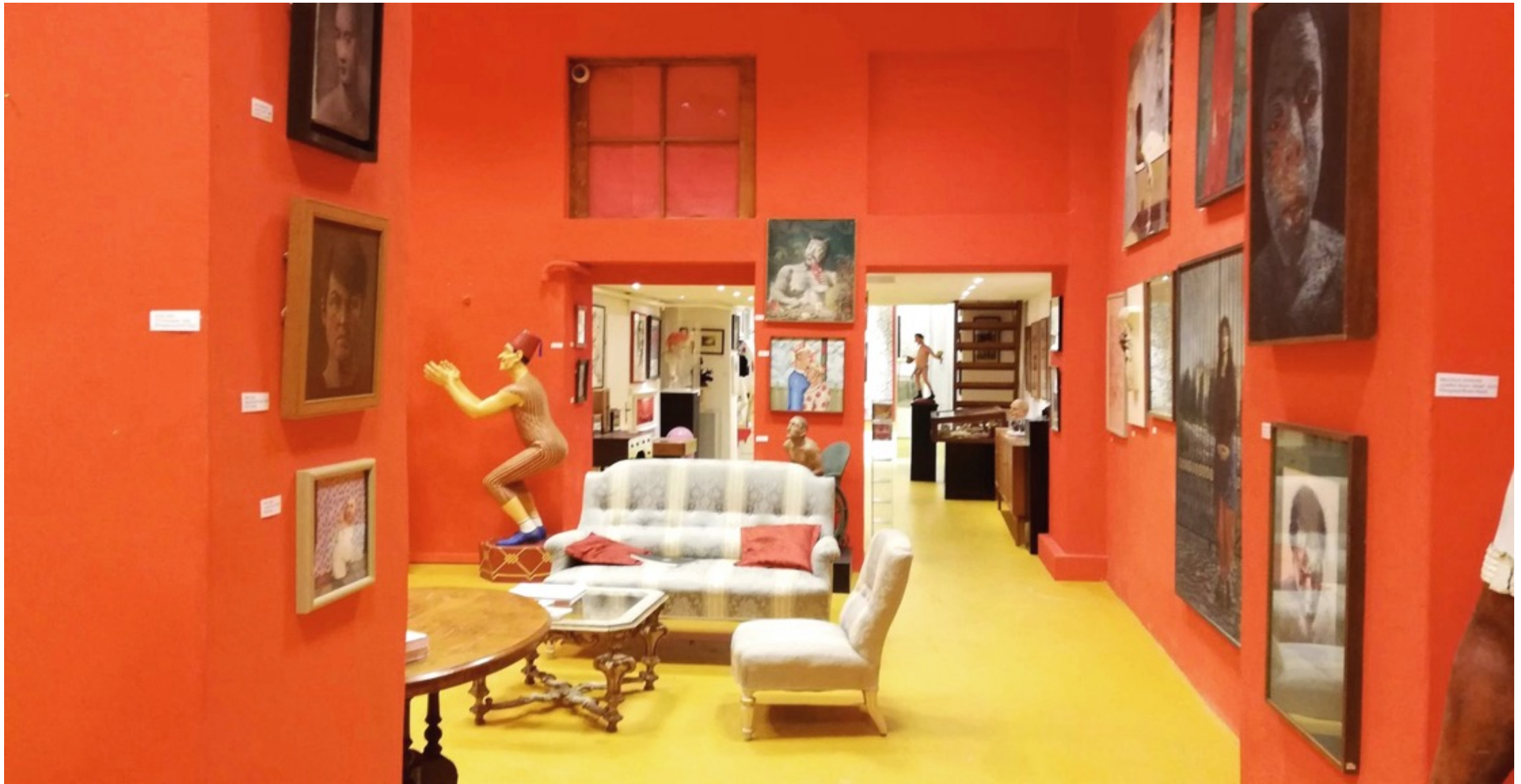
The Nicholas Treadwell Gallery, Vienna 2019