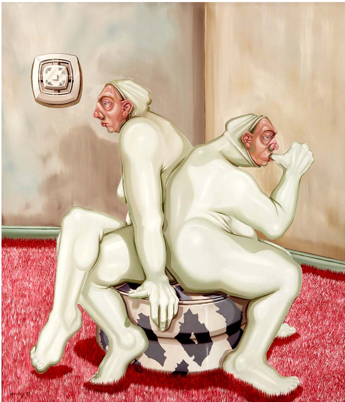
"The NonSmokers" (1995) Duncan Mosley. 90cmx102cm Oil on Canvas.