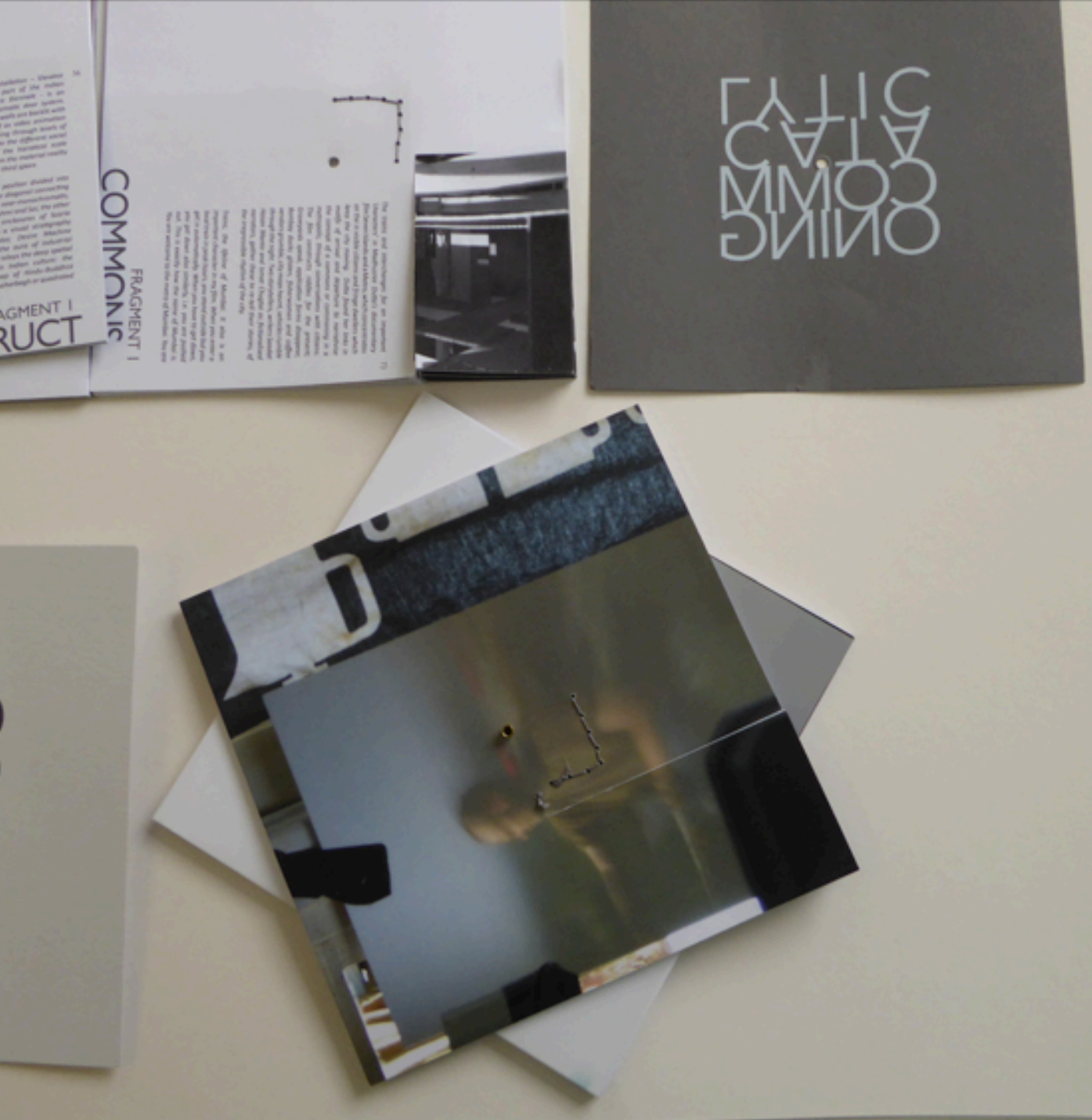
P.5. Image of the associated publication which also features contributions and commentaries from the participants, who also presented their work and ideas on the opening night.