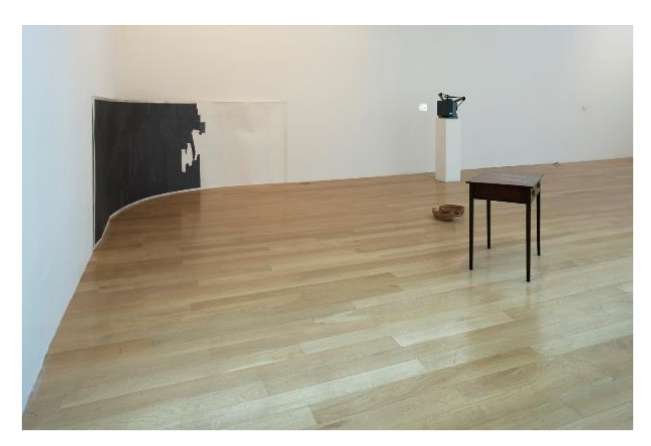
11.5 Lucy Skaer installation view at The Fruitmarket Gallery, 2008. Mixed media. Photo: Ruth Clark.

11. 4 Lucy Skaer installation view at The Fruitmarket Gallery, 2008. Mixed media. Photo: Ruth Clark.