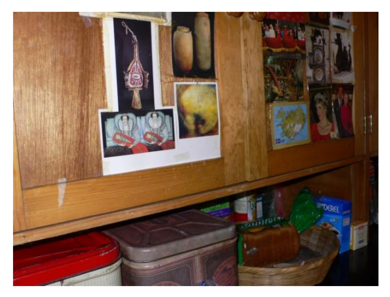
11.6 Lucy Skaer, Leonora Carrington's kitchen, showing a postcard of Tate's painting 'The Cholmondeley Ladies,' 2006. Photograph. Reproduced with kind permission of the artist.