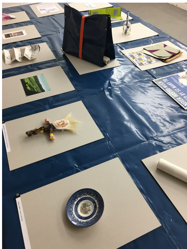
SWAP Editions: BREX-Kit at Small Press Project event 'Visions of Protest' exhibition, Slade Research Centre, Slade School of Fine Art - University College London

In March of 2019 SWAP Edition No. 4 : BREX-kit participated in the Small Press Project event 'Visions of Protest' 8th - 9th March with an exhibition and presentation at the Slade Research Centre, Slade School of Fine Art - University College London, before the official Launch and Exhibition for Edition No. 4 : BREX-kit at Creekside Projects in Deptford 21st - 24th March 2019.