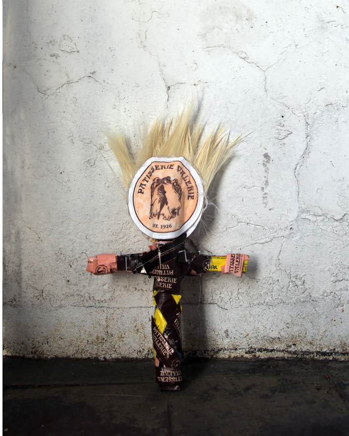
Brexit Dolls and Other Powerful Objects Dawn Woolley, 18 mixed media sculptures, 2019.