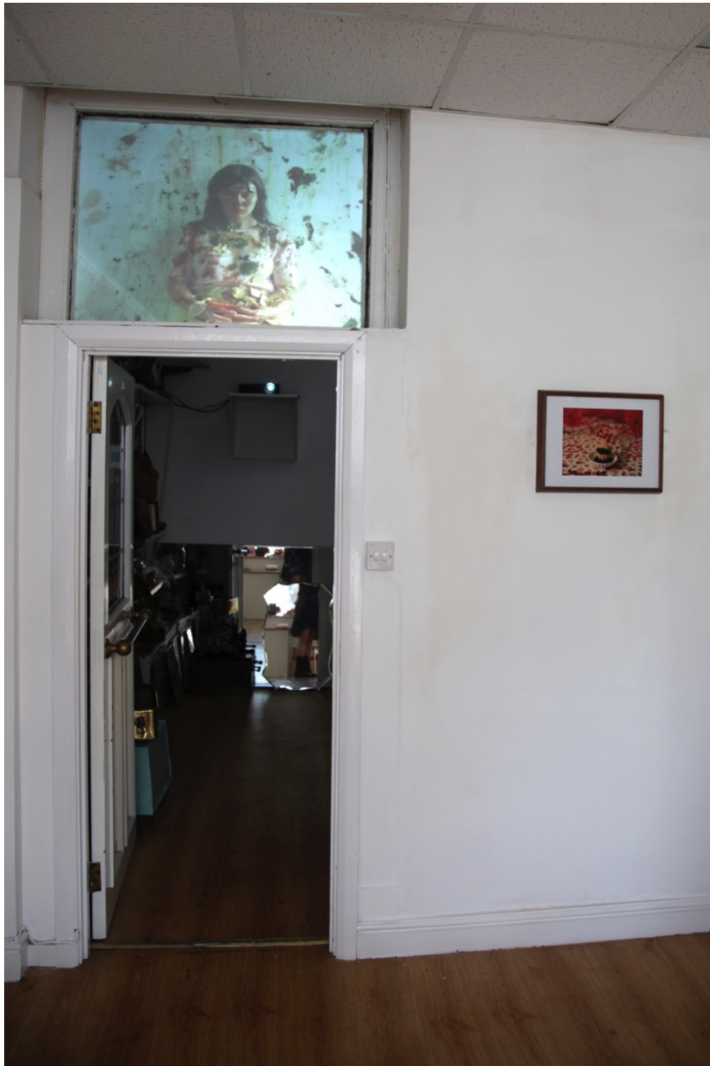
Noemi McComber, Prise d'assault (Under Assault) video