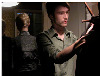
Miina Hujala Illallinen (The Dinner), 2007 [16mm film]