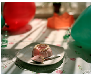
Dawn Woolley Celebrate , 2012 [photograph]

Ellen Sampson and Dawn Woolley will collaborate to create a variety of small edible sculptures which will be served to the public during the exhibition opening. With shapes, and textures derived from ideas of romance, desire and gender norms, the objects will offer a surreal take on everyday finger foods.