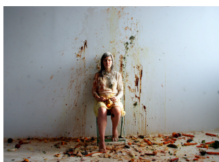
Noemi McComber Prise d'assault (Under Assault), 2011 [video performance]