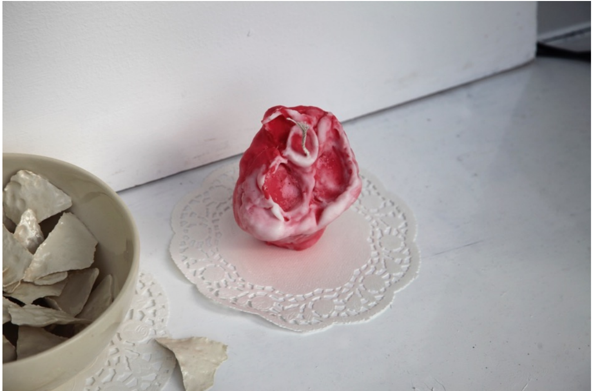
Dawn Woolley, porcelain objects and heart shaped candle.