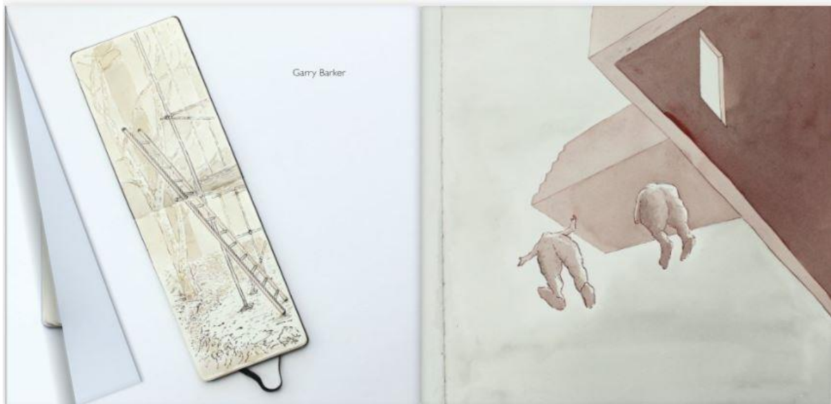
Pages from the SKETCH 2017 exhibition catalogue