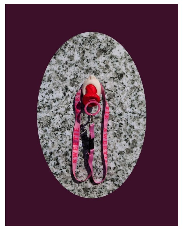
Figure 2 Dawn Woolley, Pacifier (01) digital photograph mounted on MDF, 2014, 70cm x 55cm.