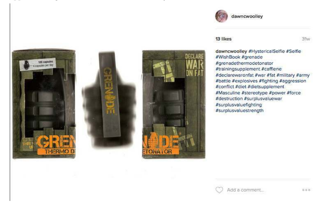
Figure 7 Dawn Woolley, Wishbook (Grenade) , images and hashtags posted on Instagram, 2015–18, https://www.instagram.com/dawncwoolley/.