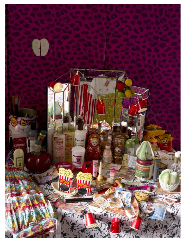
Figure 6 Dawn Woolley, Hysterical Selfie (Bite Me), pop-up display banner, 2015.