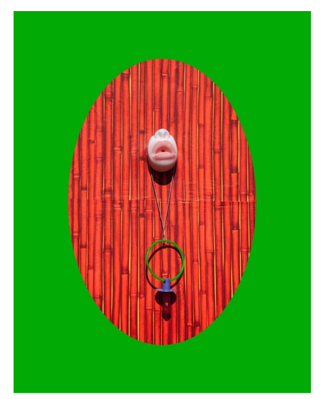
Figure 3 Dawn Woolley, Pacifier (05) digital photograph mounted on MDF, 2014, 70cm x 55cm.