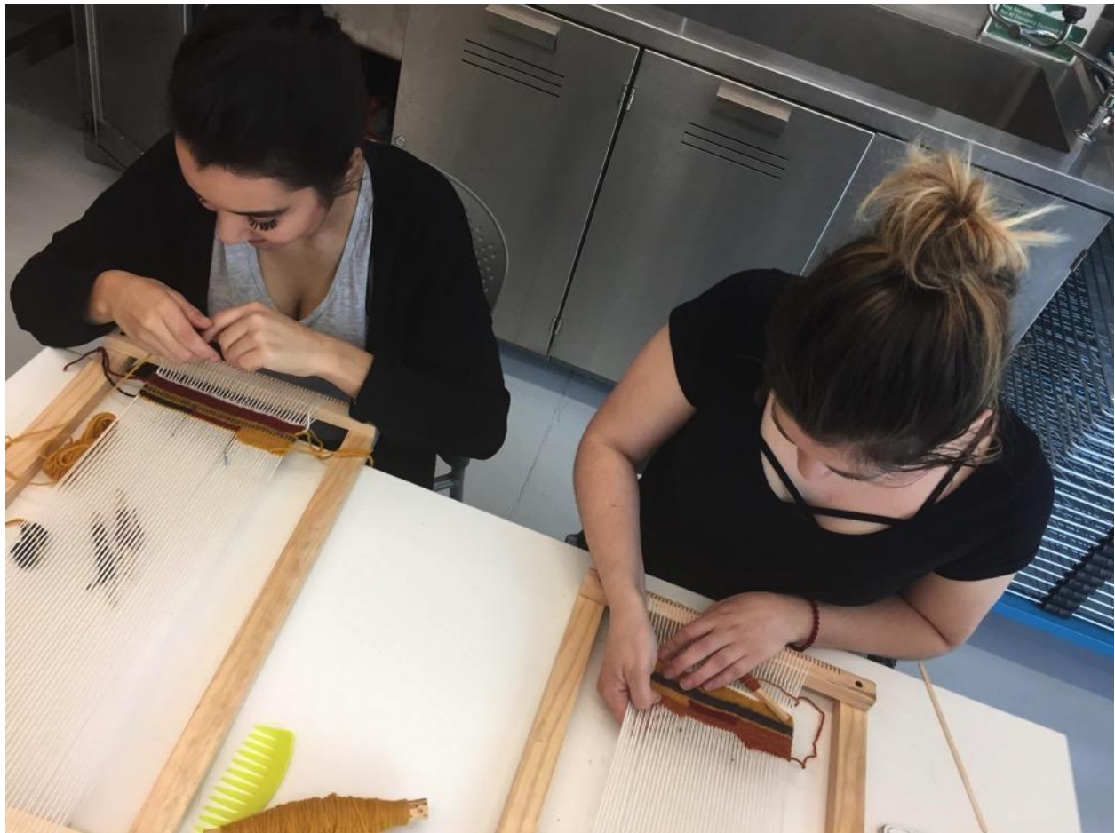
Figure 4. Students weaving on their frame loom.

Although the form of weaving is very similar to other ones, what makes the textiles developed unique are the motifs and designs created. The professor explained how to weave the diagonal motif so that it could be used as a basis in order to create more complex designs.