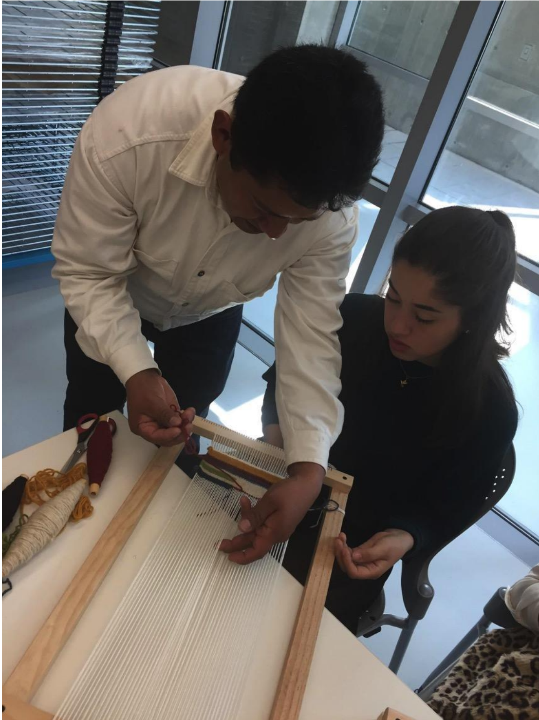
Figure 3. The instructor shows a student how to improve her weave.