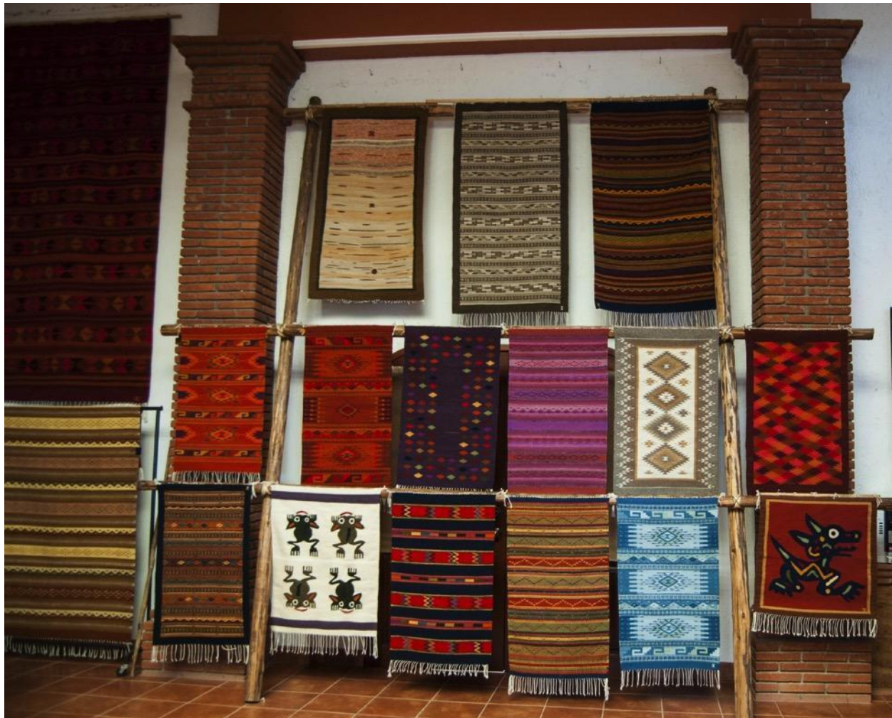
Figure 1. Zapotec Textiles produced in Teotitlán del Valle.

Zapotecs see the design, or at least geometric patterns, in terms of rectangular and triangular blocks of colors that are, in turn, built up out of narrow stripes of color. They do not lay designs in either centimeters or inches rather by blocks of color.