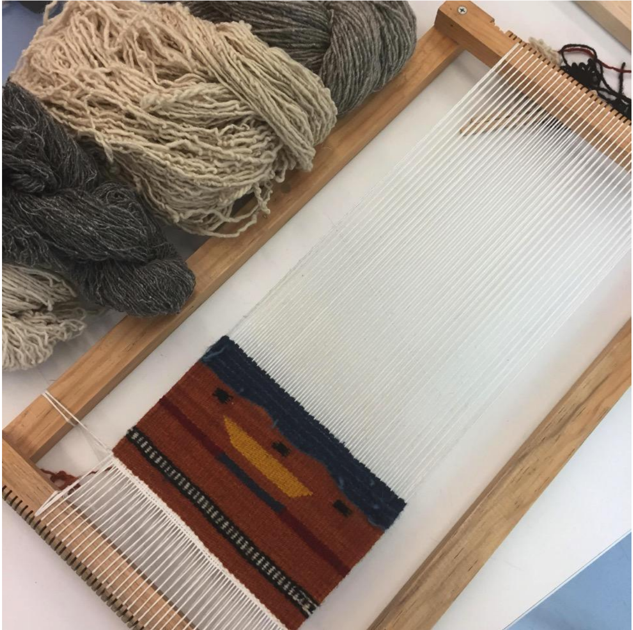
Figure 5. Patterns created by the different techniques taught during the workshop.

session was over, he presented more wool yarn in different hues than the ones that had been used in the duration of the course. The yarn was offered so that participants could create their own designs based on the techniques that they had been taught.