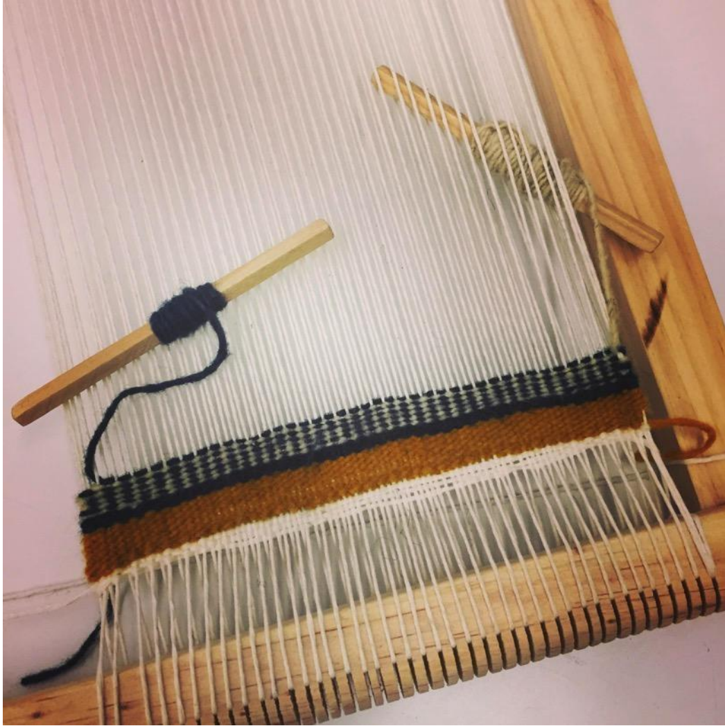
Figure 2. Process of weaving.