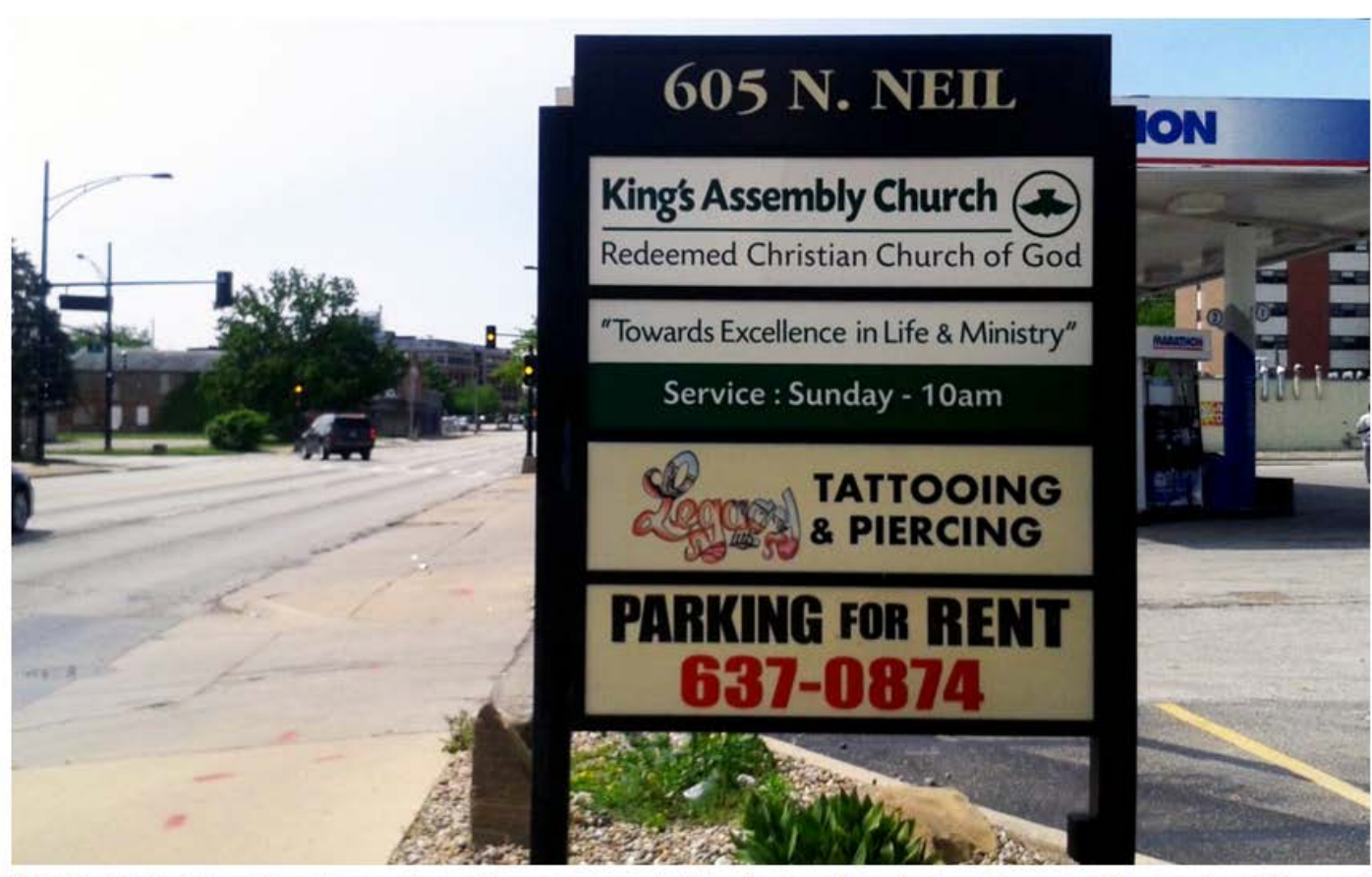
North Neil Street caters for all comers: tattooing, piercing and excellence in life and ministry.