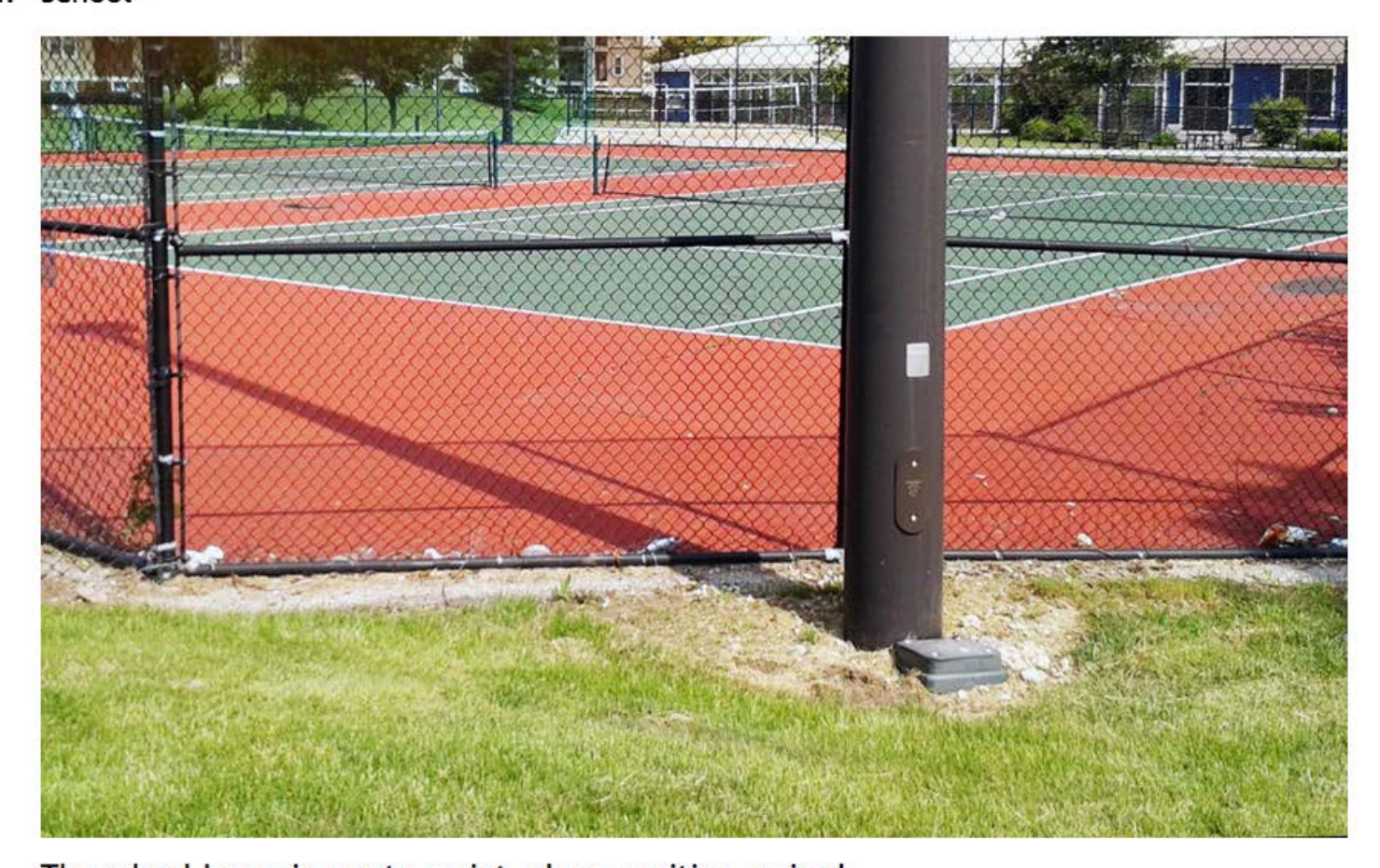
The school I pass is empty, quiet, clean, waiting, poised.