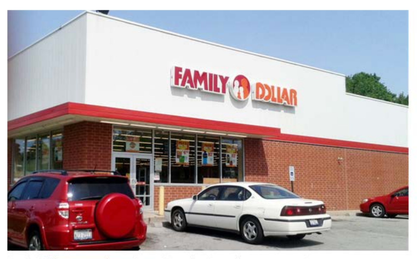
Family Dollar supermarket unites us in our basic needs: to eat to survive, to save to progressto sustain our bodies