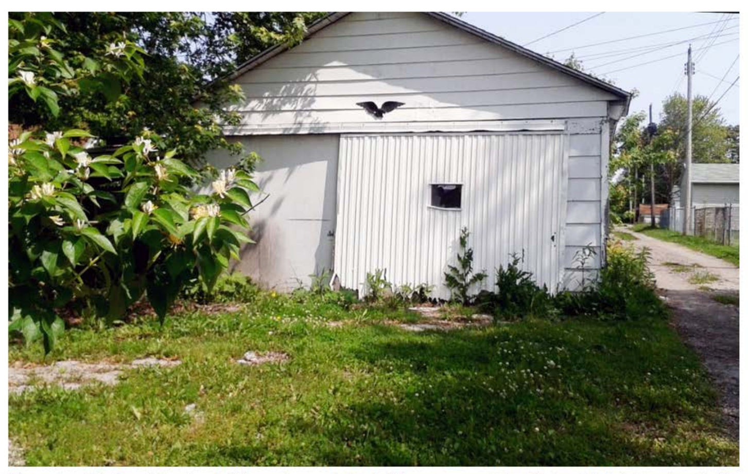
There's a bird on the shed. It's not a real bird. It's a renewable bird, a tin bird, a facsimile of a bird. Everywhere there are birds. The robins in Urbana are huge. And it's only May.