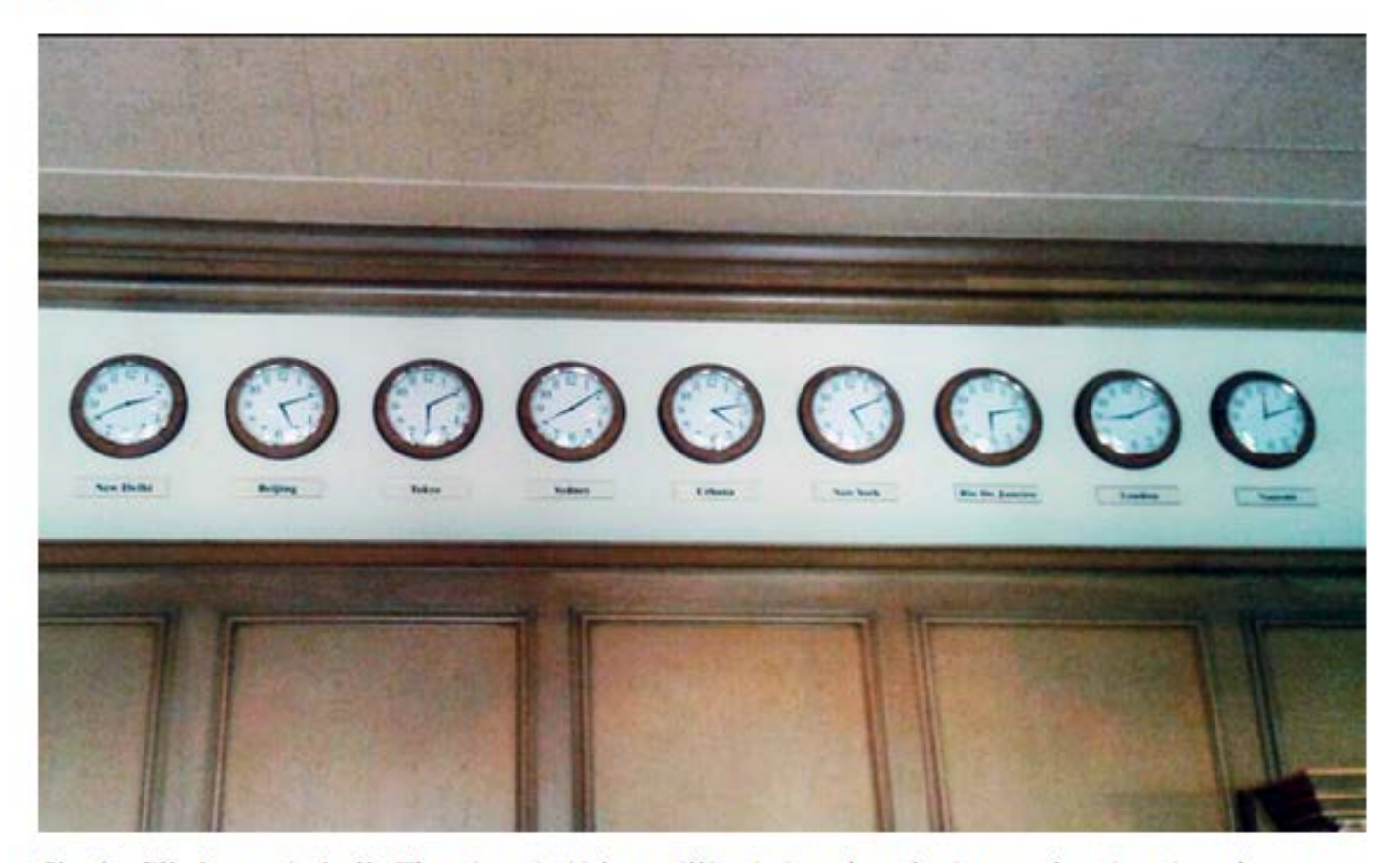
Clocks fill the main hall. The time in Urbana Illinois is only relative to the time in other parts of our world.