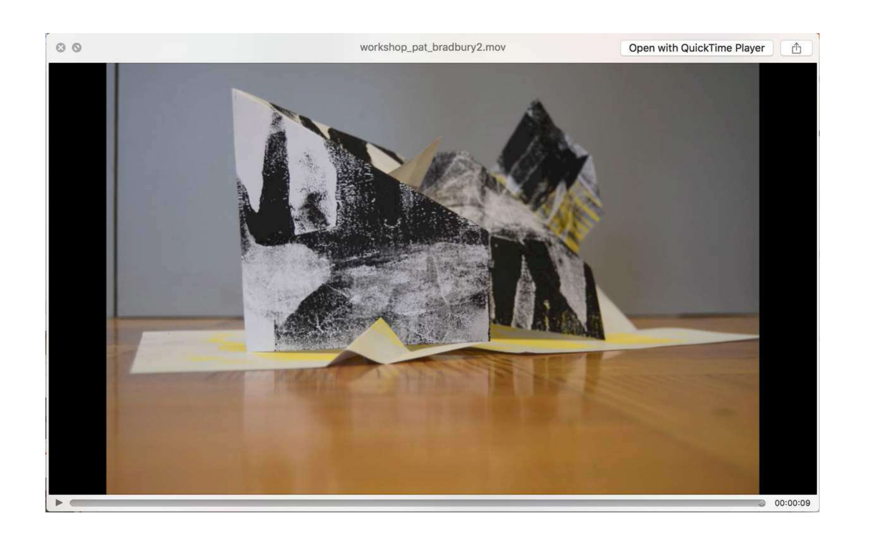
Explore animation / moving image