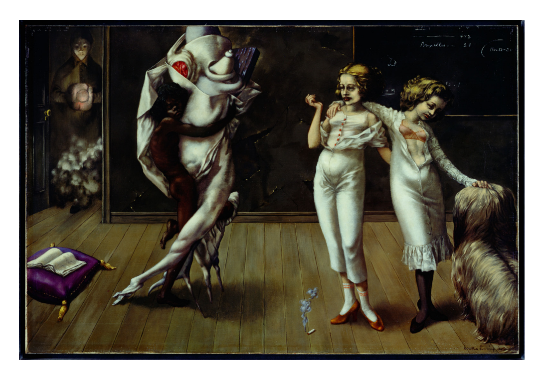
Fig. 6. Dorothea Tanning, Interior with Sudden Joy , 1951. Collection Selma Ertegun, New York

Little girls in white dresses populate Tanning's diminutive, dollhouse-like canvases such as Eine Kleine Nachtmusik (1943) and Interior with Sudden Joy (1951)—both painted in Sedona—where the sublime effects of the vast surrounding landscape have driven her inside her domestic imagination (Fig. 6).<sup>38</sup> Indeed, both serve as examples of introversion, a miniature, interior perspective contained deliberately, in contrast to the unruly vastness of geological time and the Hollywood spectacular outside. Suggestions of "a little night music" and "sudden joy" both evoke the climatic, or even the explosive, and what Soo Y. Kang has referred to as a form of Lacanian jouissance in terms of Tanning's effort at cracking or "jamming" the system.<sup>39</sup> Both feature femmes-enfants (child-women) embroiled in a kind of naughty