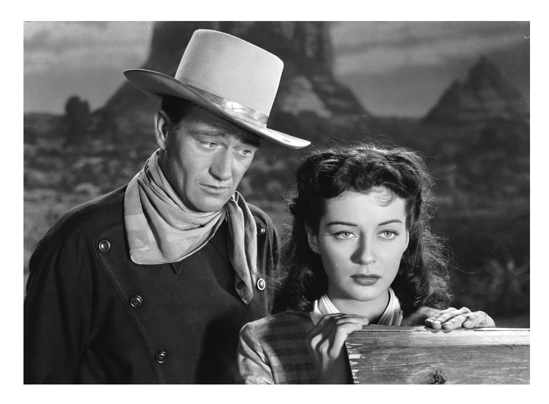
Fig. 3. Still from Angel and the Badman, 1947.