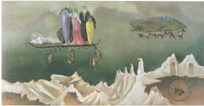
Fig. 4. Leonora Carrington, La chasse , 1942. © Estate of Leonora Carrington / ARS, NY and DACS, London 2018.