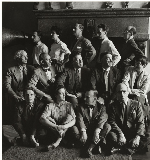
Fig. 1. Hermann Landshoff, Artists in Exile group photo of Surrealists, New York, 1942