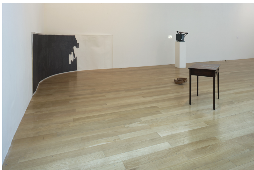
Fig. 3. Lucy Skaer installation view at The Fruitmarket Gallery, 2008. Mixed media. Photo Ruth Clark. Courtesy the artist. Copyright The Fruitmarket Gallery, Edinburgh. Source: Ruth Clark

Metamorphosis is everywhere in Carrington's realm, and presents an alternative mode of thinking. Indeed, such unsettling imagery may be seen to operate on a much more conceptual basis. Skaer's Leonora (2006) represents the younger artist's ambivalent encounter with her "wild card" as a multimedia installation or topographical inquiry, comprising, amongst other objects, a short 16mm film portrait of Carrington, The Joker ; a mother of pearl in-laid mahogany table, The Tyrant ; and a large drawing comprising tiny black spirals, Death . Here, the Tarot also becomes a means of esoteric curation for Skaer, and the very arrangement of Skaer's artworks in installation format could be said to evoke (or reflect) Carrington's disembodied wartime compositions.