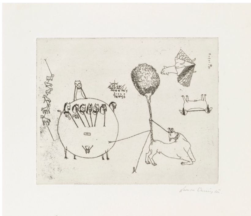
Fig. 2. Leonora Carrington, Untitled (The Dogs of the Sleeper) from VVV Portfolio, 1942. © Estate of Leonora Carrington / ARS, NY and DACS, London 2018.