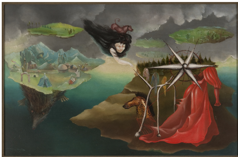
Fig. 5. Leonora Carrington, Artes 110, 1942.