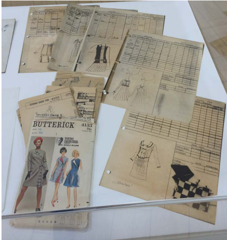
Figure 7. Costing sheets with sketches and fabrics and Butterick pattern designs displayed in The Radical Decade exhibition, Leeds 2016. Image courtesy of Butterick @ B4133 Image courtesy of The McCall Pattern Co., Inc. copyright @2017 and Ann Walls owner of the Gerald McCann archive. © Photograph courtesy of Kevin Almond.