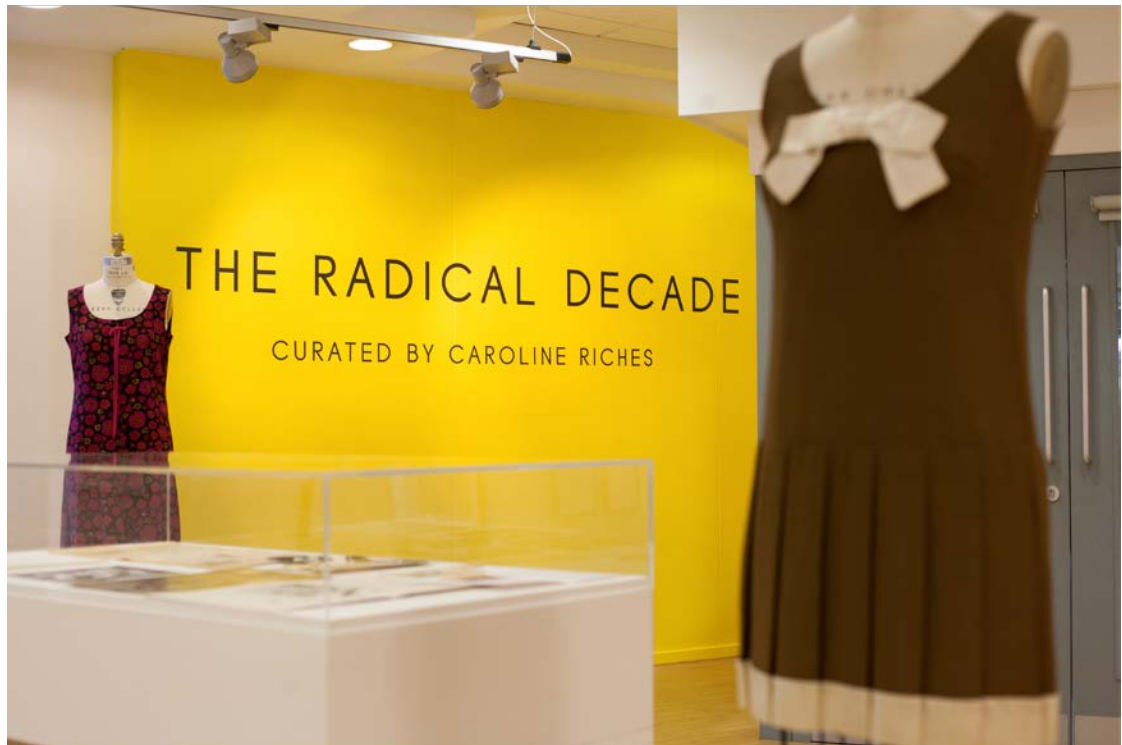
Figure 8. The Radical Decade exhibition, Leeds 2016, curated by Caroline Riches. (The flower print dress purchased by Caroline Riches on ebay and the brown and cream dress was lent by Rosemary Norris).

The rationale for mounting the exhibition evolved from the initial discovery of the McCann archive, combined with Leeds Arts University's burgeoning exhibition policy. Former major exhibitions at the university had focused on fine art related subjects but the university recognized they needed to diversify to reflect the increasingly high profile, design related activities within the institution. The location in Leeds, West Yorkshire, the traditional heartland of British textile manufacture also gave the display of fashion an increased gravitas. The exhibition proposal was internationally peer reviewed by an Exhibitions Advisory Board put together by the university. It included specialist reviewers from the Metropolitan Museum of Art in New York and Goldsmiths College in London. One reviewer commented (anonymously), 'The Gerald McCann, exhibition