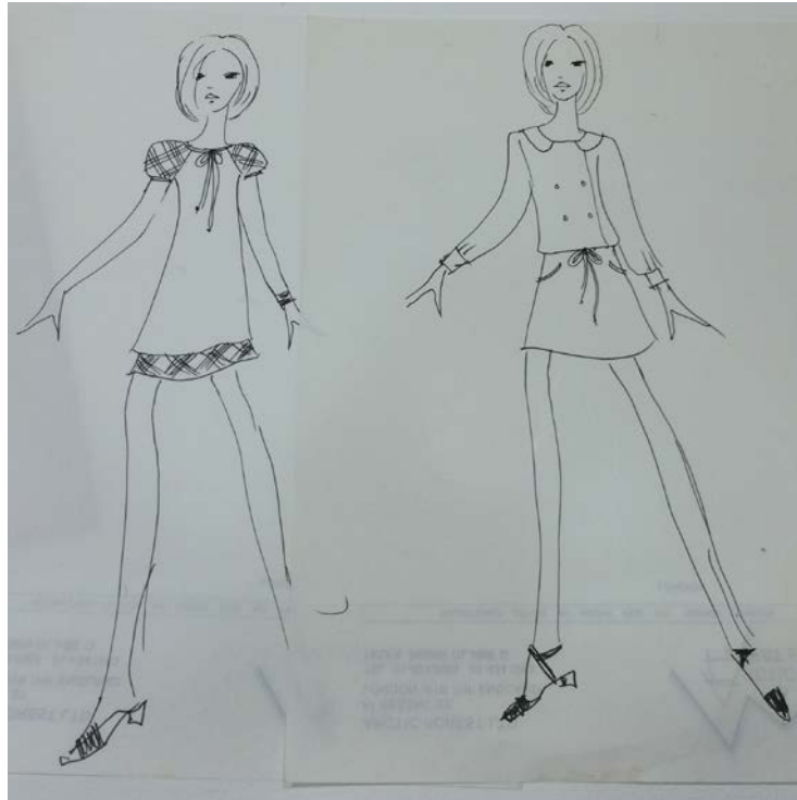
Figure 3. Simple but youthful clothes - sketches by Gerald McCann. Courtesy of Ann Walls, owner of the Gerald McCann archive. © Photograph courtesy of Kevin Almond.

Significantly McCann also began to supply designs for Topshop, which began as a brand extension of the department store Peter Robinson in 1964 and had shops in London and Sheffield. Topshop was one of the first UK high street chains to supply clothes to the youth market and is today a multinational retailer. McCann's name also became well known as a pattern designer for the burgeoning home sewing market, when he began producing designs for Butterick Patterns as illustrated in Figure 4. He furthermore expanded into the male market, sporadically throughout the 1960s but by 1970 was established with a menswear collection.