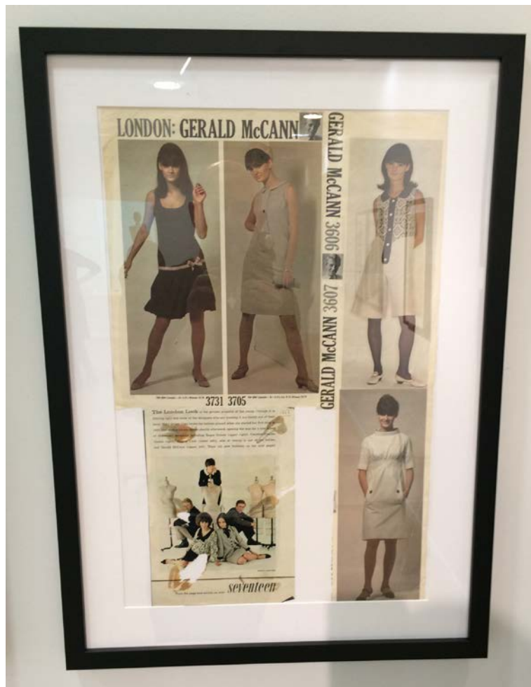
Figure 9. Gerald McCann press photographs from The Radical Decade exhibition, Leeds 2016.

collars and A-line silhouettes in gingham, polka dots and silk crepe, could be observed.